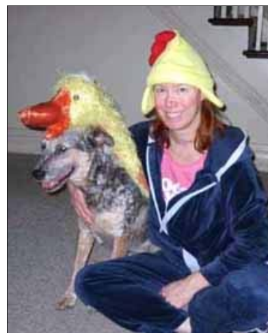
Practicing which came first, the Chicken or the Duck.