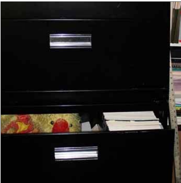
She then begged for a position as an administrative assistant that could provide ever-present wisdom and softness.