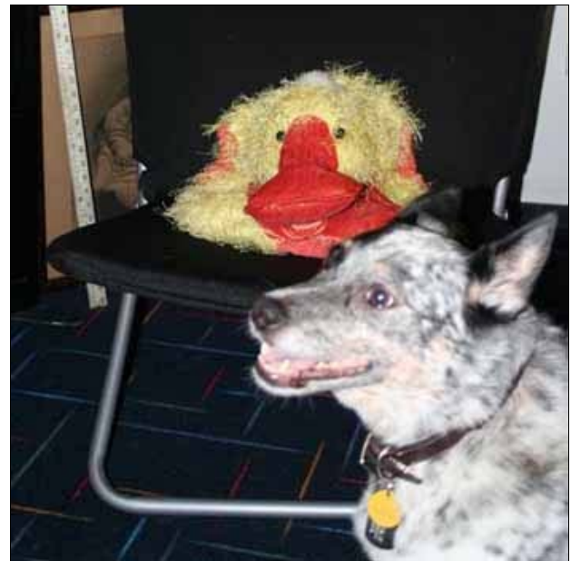
Ku'a was not ready to be retired.