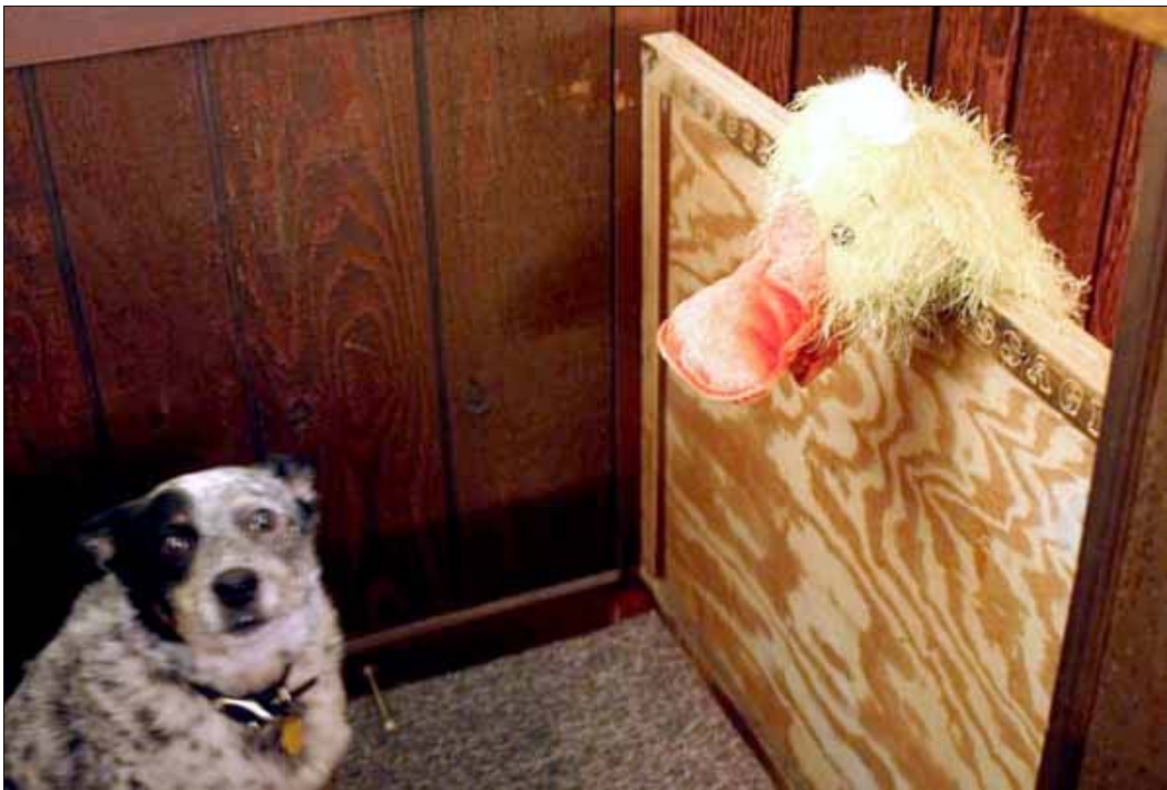
Ku'a attempted to commiserate, but became distressed with pity and appealed to the photographer to put an end to things. Also see photo below.