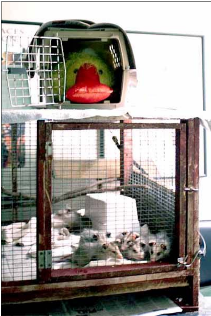
She masqueraded as an opossum in need of rehabilitation. She forgot that opossums have long, naked tails and that she did not. You will notice that the Real Thing below her were not impressed.