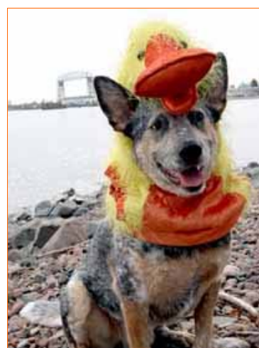
Click for larger image This photo was taken on the beach not far from the Duluth landmark Lift Bridge that you see in the background. (Much to Duke's dismay, several dogs passing by during the fashion photo shoot were heard to chuckle quite loudly!)