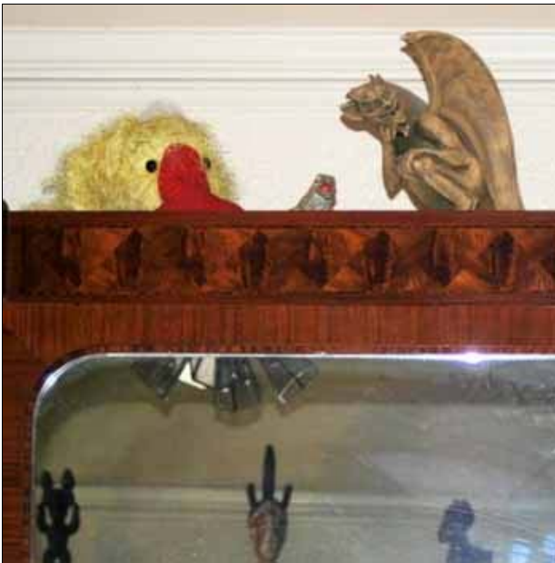
She sought to mingle with the locals, but gargoyle and lizard gave her away.