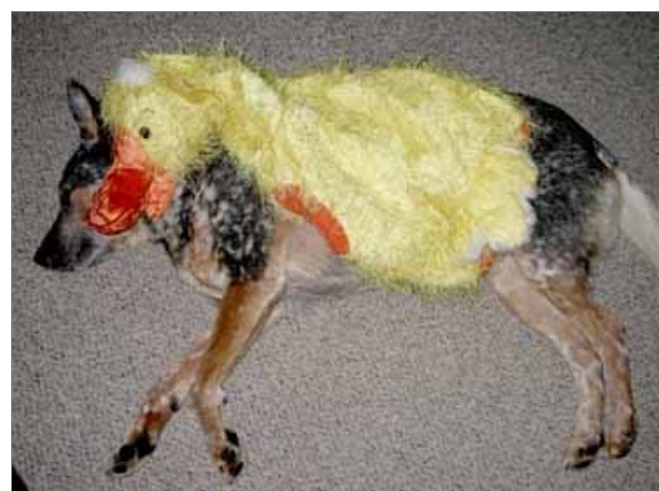
Click for larger image Duke and Duck take a catnap after the Humiliation at the Bridge.