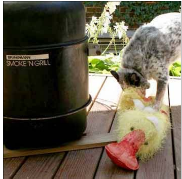
Last, she decided to wear black. Big, black stainless steel.

And finally, Ku's photo shoot, seemingly a struggle to find just the right balance between being striking drop-dead gorgeous poses, maintaining movie-star aloof and wondering exactly how one goes about gracefully ripping a duck off your back with the camera watching.