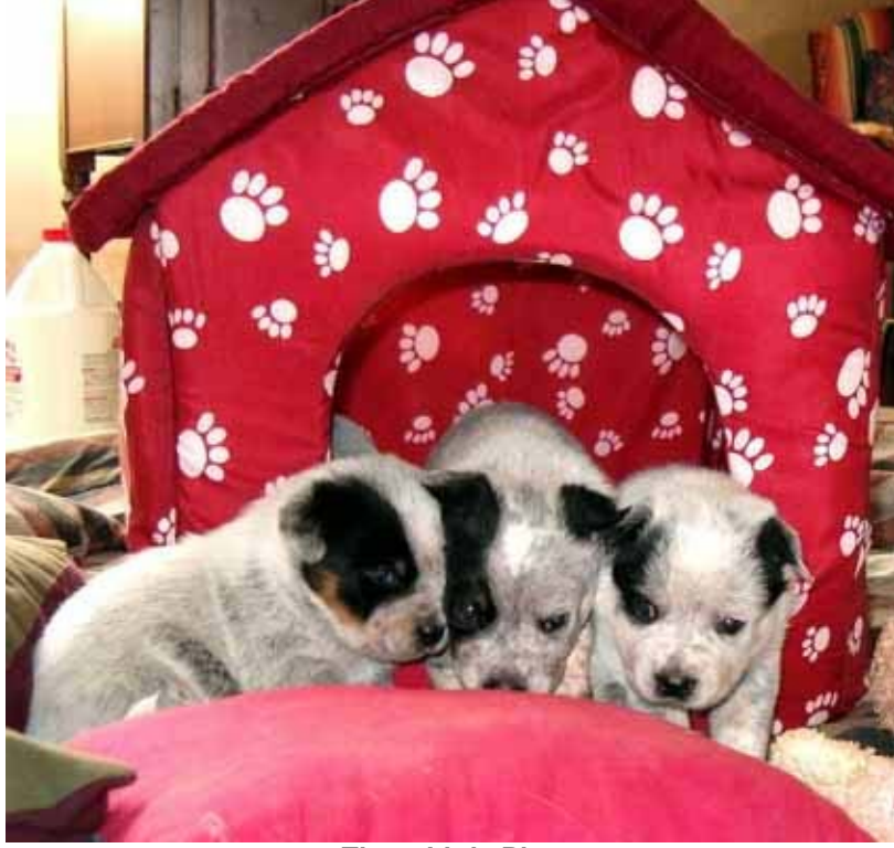
Three Little Pigs

Comrade Kit Cuts a Caper In yet another shocking Daily Shriek exclusive, photographer Pop Arrazi follows Comrade Kit as she abandons her children and heads to New Orleans. "It isn't abandonment," claims the WayOut castle spokesperson. "Comrade Kit just needed a little break and felt that she would be a big hit at Mardi Gras this year. The Royal puppies did not even have a chance to notice her absence, and we were very careful to limit their television and Internet access so that no inappropriate pictures of their mother would reach their innocent eyes."