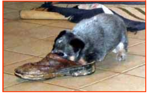
SHOE FETISH TinCup impersonates a platypus.

Consider the hiring of a wetnurse for the babies. While Hello Kitty seems to be doing a fine job, what were her references? Did anyone check?