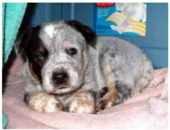
Rubbermaid is said to be interested in pursuing more product placement opportunities with TwoGun.