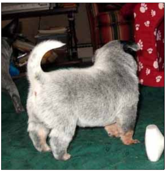
TinCup curiously refuses photo op: family shame?