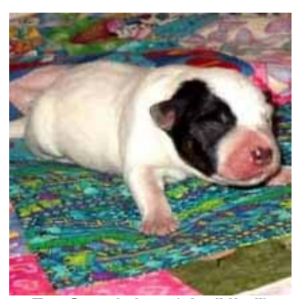
TwoGun, 2 days (aka "Jim")