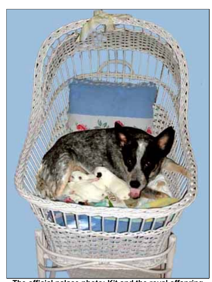
The official palace photo: Kit and the royal offspring

Prince held in seclusion, threatens investigation