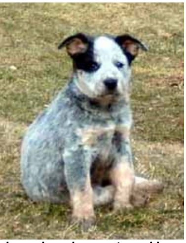
TeaPot wonders where her next meal is coming from.