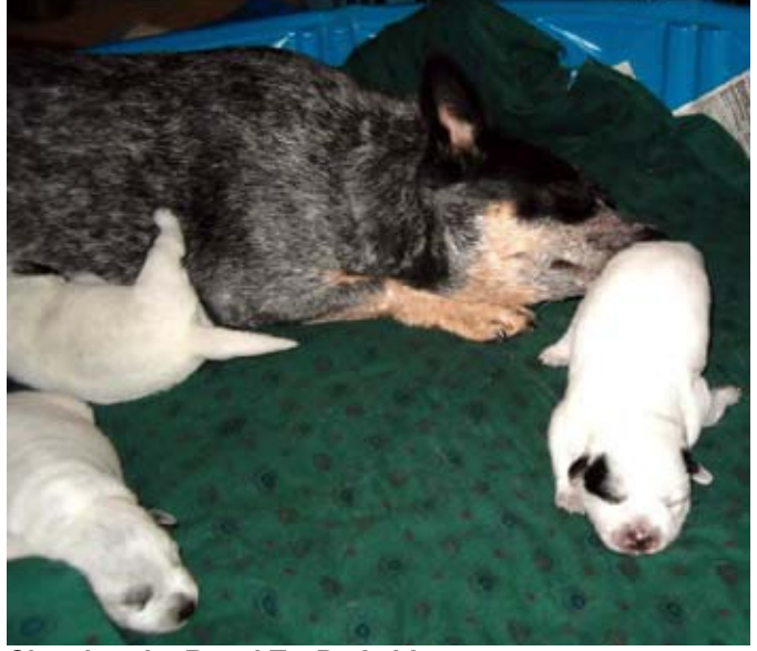
Cleaning the Royal TeaPot's hiney