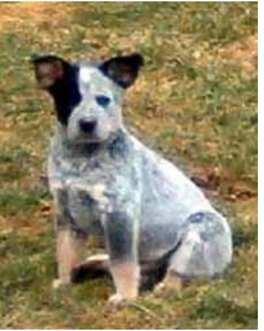
WayOut Castle is pleased to announce that even the rather oversized ears of TwoGun are beginning to show some lift.