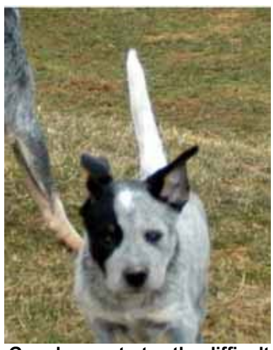
TwoGun demonstrates the difficulty of maintaining good photographic technique when attempting to take pictures of 7-week-old puppies.