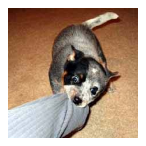
TinCup has modified her future career choice and now wishes to do any type of bitework - not just on cows.

Dark horse Posey may still manage to steal the victory, say castle sources in an exclusive Daily Shriek interview. "She's a plain face, no one can deny she doesn't have the glamorous good looks of her sisters but I think there is a lot to little Posey," stated the Personal Attendant to Prince Slate. "She has a lot of attitude and that has to count for something. I think given more exposure with the sheep, she will come to show what she is made out of."