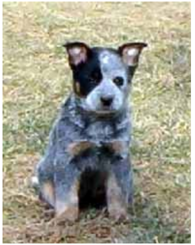
TinCup recovers from the traumas of the day.