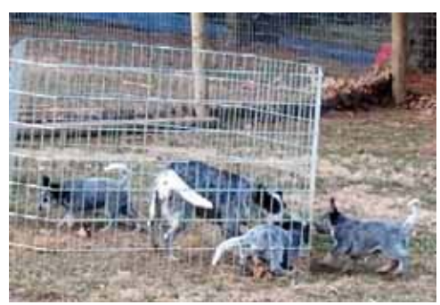
Kit shows the puppies how proper fence-fighting is done.