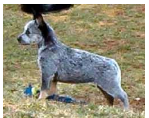
Except, of course, for the current favorite Posey