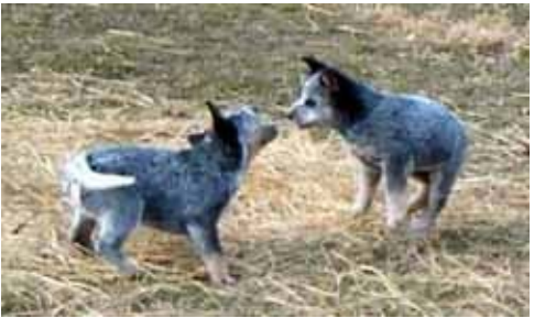
TinCup and Posey practice their self defense homework.