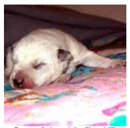
Posey, 2 days (aka "Ingrid")