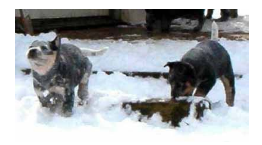
Potty breaks free from the pack