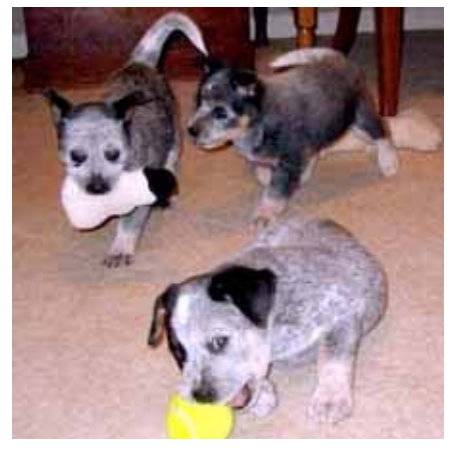
TwoGun and Posey demonstrate proper puppy play for a training video (aimed at delinquents like TinCup).

TeaPot refused to be included in this photo shoot due to a profound lack of desire to get far enough away from the photographer for the camera to focus.