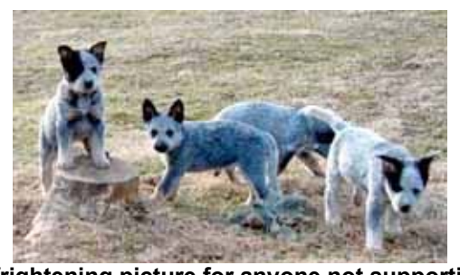
A frightening picture for anyone not supporting the revolution! TinCup declaims on the stump while her thugs prowl below. (Not for the faint of heart, take note of the trodden remains of a dissident in the larger photo.)