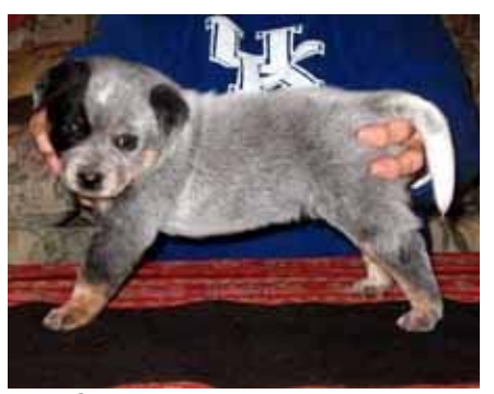
TinCup valiantly attempts to play along