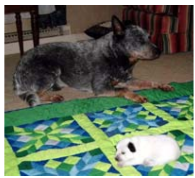
The good father: prince and heir

The Daily Shriek also spoke to Prince Slate who has vigorously denied all knowledge of the Puppies' escapade to the North Pole. "I never spoke to them! I never told them what trains run north! I never gave any instructions to the train station!" insisted the prince vehemently. "I love my babies and would never mislead them!" he further stated.