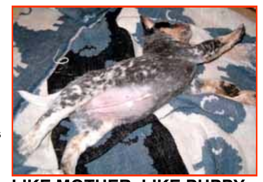
LIKE MOTHER, LIKE PUPPY TeaPot practices her glamour look: Where is her fur rug?

Passing quickly over the episode of Comrade Kit's travels to New Orleans for Mardi Gras, is it any wonder that one of the first news items to hit the press regarding these poor innocent babes was their running off to the North Pole? We won't even hint at the rumor that Prince Slate was behind that little escapade but it looks badly for the WayOut family.