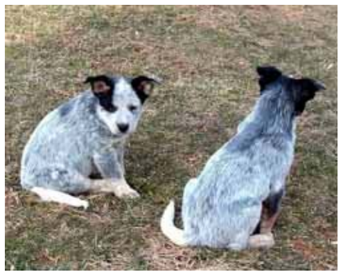
What you get when you sing "I want a hippopotamus for Christmas" too frequently while your bitch is in whelp.