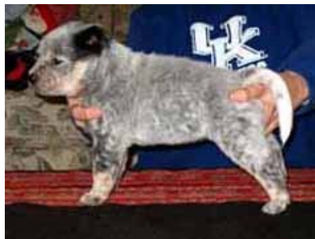
TeaPot struggles to maintain her composure.