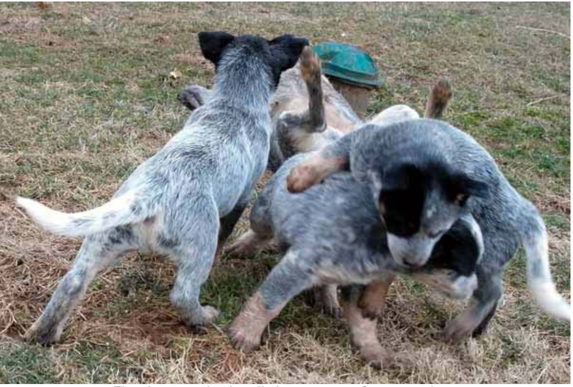
The photo session is called on account of mass mayhem as everyone wants to get involved in the game.