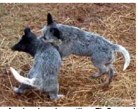
Semi-professional mud wrestling: TinCup and Posey get down and dirty in the mud pit -- demonstrating the reason behind the difficulty in maintaining the color of the off-white carpet in the house.