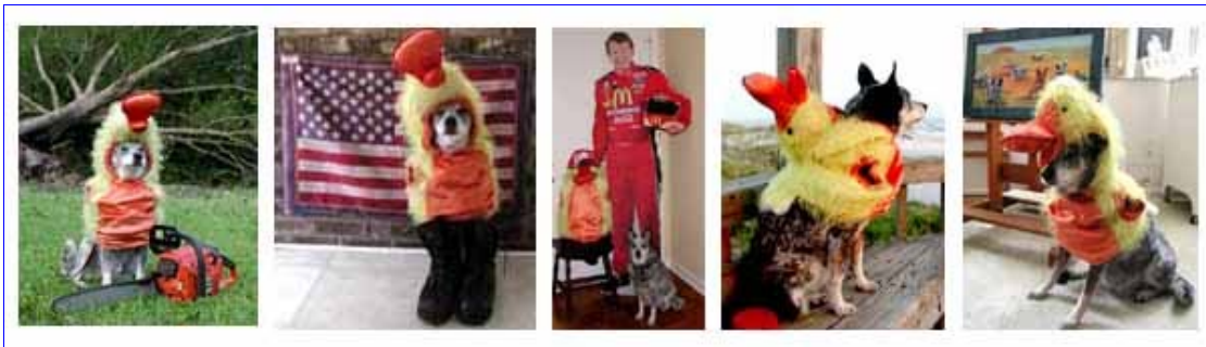
(Click on each photo to enlarge)