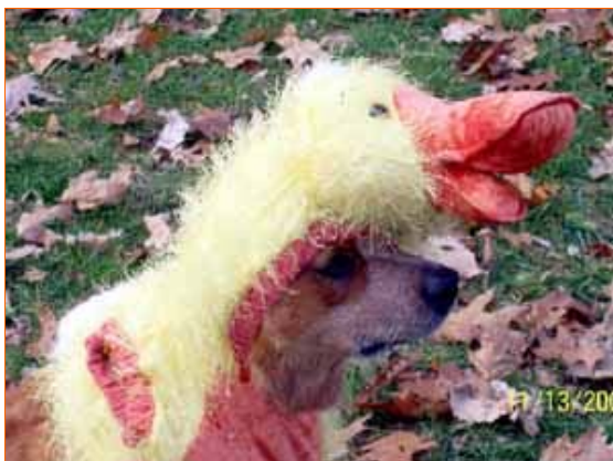
SIMON Jurain (top) stares in disbelief at the scene