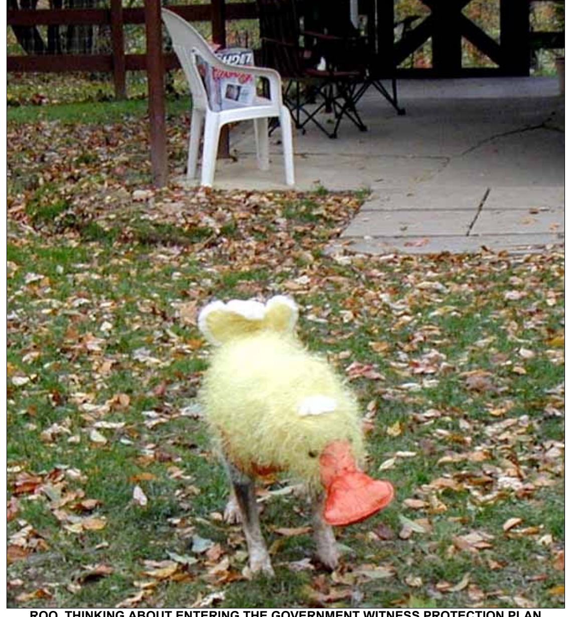
ROO, THINKING ABOUT ENTERING THE GOVERNMENT WITNESS PROTECTION PLAN IN COMPLETE DISGUISE.