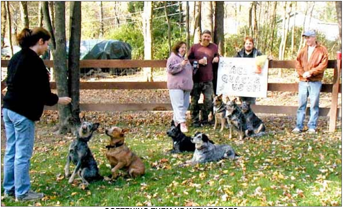
SOFTENING THEM UP WITH TREATS