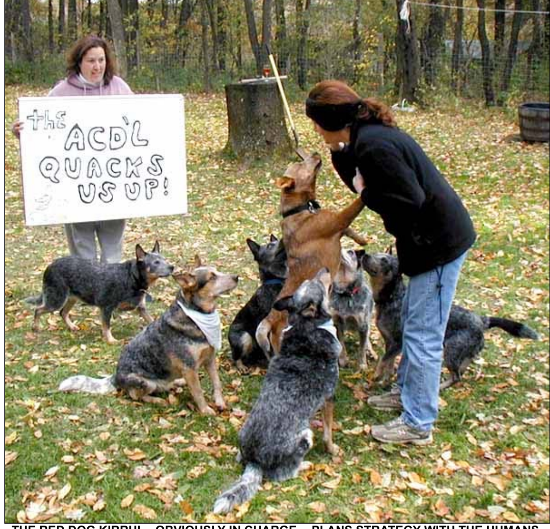
THE RED DOG KIRRHI -- OBVIOUSLY IN CHARGE -- PLANS STRATEGY WITH THE HUMANS.