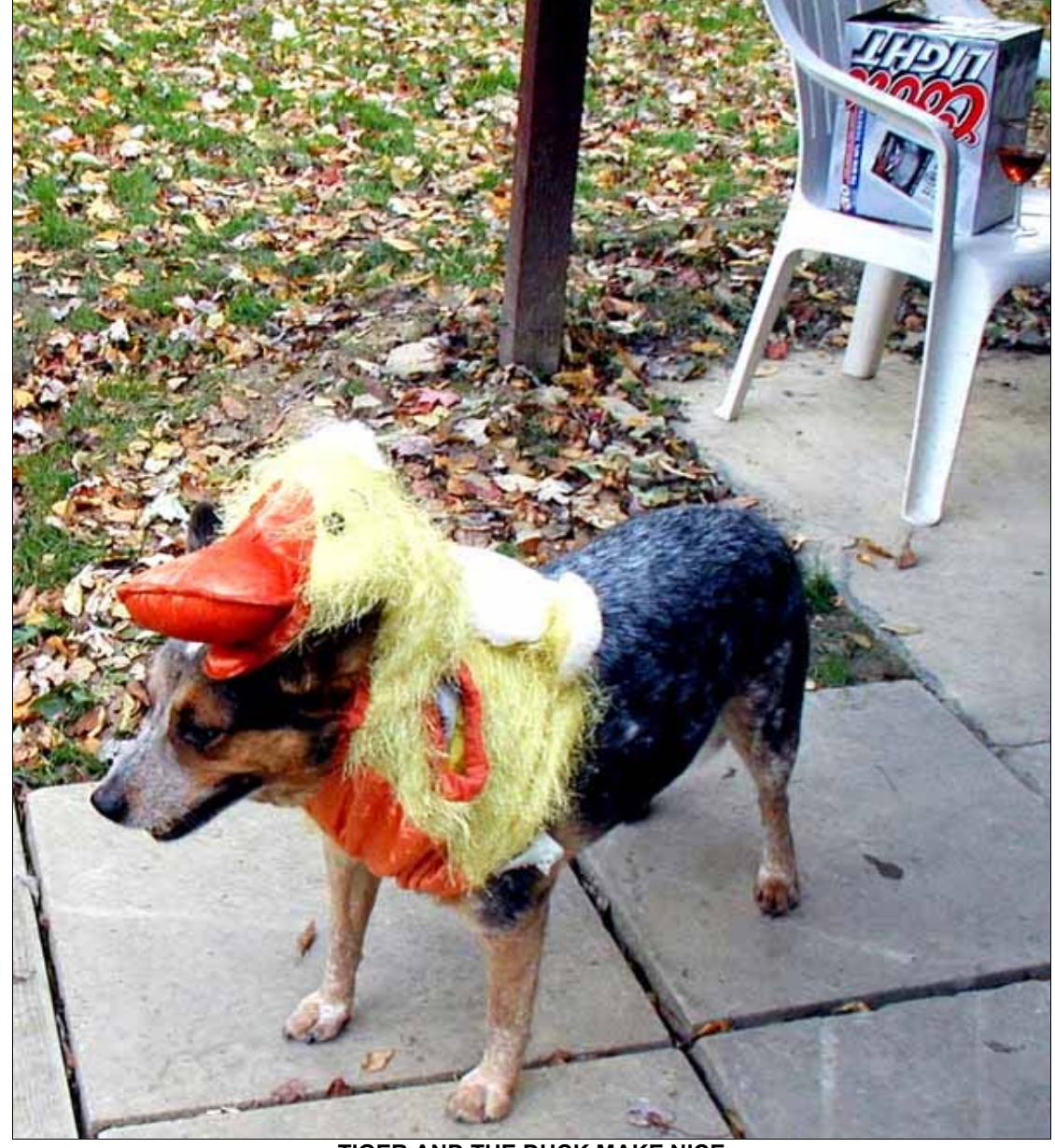
TIGER AND THE DUCK MAKE NICE