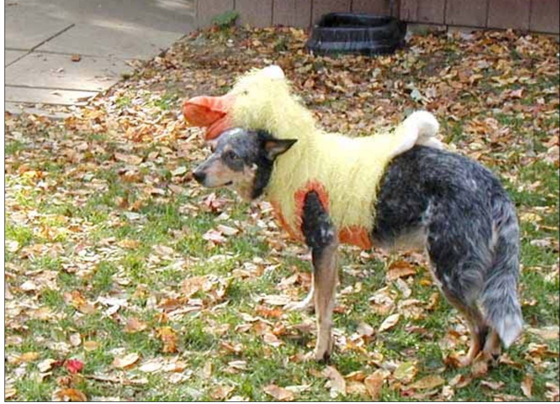
ELVIS, THE SERENE